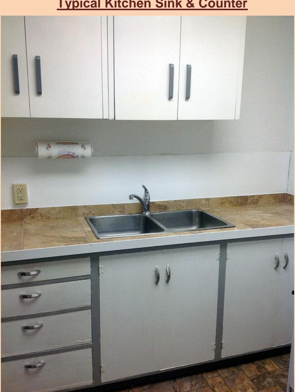
Typical Kitchen Sink & Counter

The building is 6,912 square feet on 4 levels, being 10 rental units plus a utility area on a 9,000 square foot lot. The building has hot water heat with a natural gas fired boiler. Some off street parking is available at this property. Of the rental units 8 are 1 bedroom, 1 bath; one 2 bedroom, 1 bath and one 3 bedroom, 2 bath. All units are furnished with kitchen stove and refrigerator.